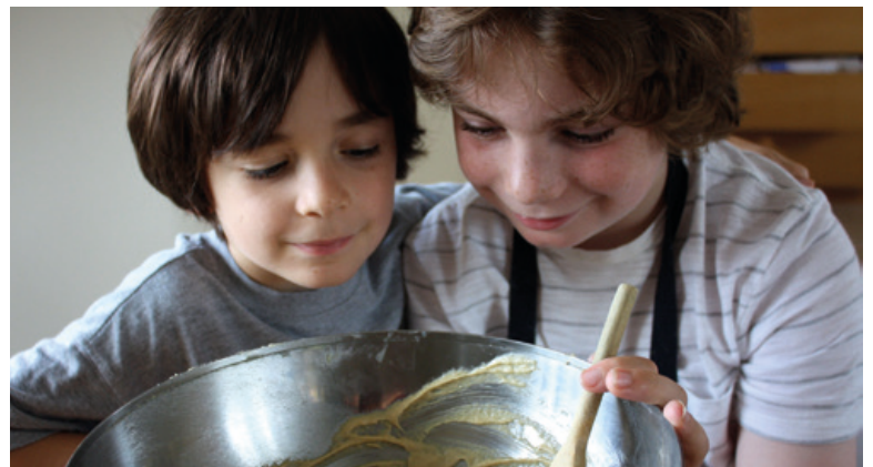
Practising those baking skills ahead of competition day

Visit www.shipstonfoodfestival.co.uk for more details.