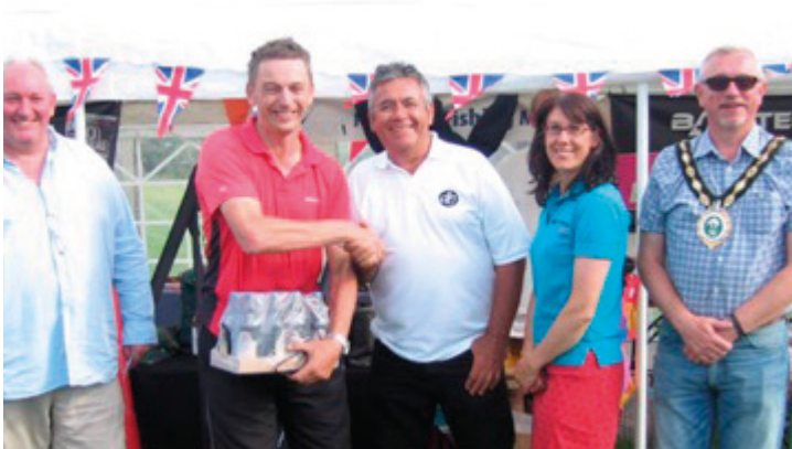
The Fish N Frolics event was a great success