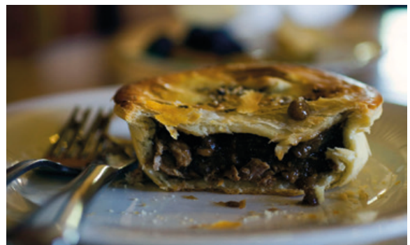
Are you up for the Sheep Pie Challenge?

For more details about Shipston's Food Festival, turn to page six.