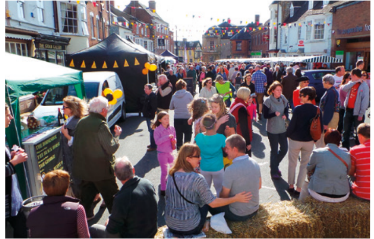
Crowds packed the square during last year's food festival